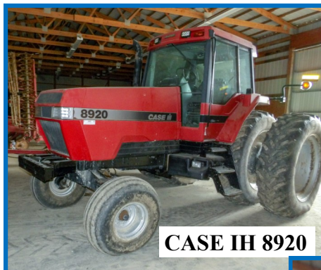
CASE IH 8920

Case IH 8920 (JJA0073753) tractor duals, 2 wheel drive, 3075 hrs: Case IH 4894 duals 80% rubber, remotes, 3pt, repaint: Massey Ferguson 1100 diesel: Deutz D100-06: Massey Ferguson 50HX backhoe 4 wheel drive power shuttle: Kinze 3600 12-23 30 inch rows (#623738): J&M seed wagon w/tarp and auger: New Idea 708 hydro unisystem w/3 row head: Case IH 496 disk 20': J&M 525 grain cart w/scales corner auger (nice): J&M 500 BU gravity wagon w/double side boards, brakes, lights, 20 ton gear, center dump, Mayrath10"X30' swing auger, Mayrath10"X62' swing auger: 10"X36' auger, Sunflower 642 mulcher finisher #3432-30: Unverferth 1225: 33' rolling harrow: Snyder Ind. water tank on trailer w/pump: Burchwing disk 16': New Idea hay and corn PTO elevator 45' (nice): Bushhog 121-09 hyd 9' blade 3pt: Bushhog 10' bush hog pull type: 6' Bushhog: 2 flat wagons, MF 3pt 4 bottom rollover plow: various poly water tanks: Oliver lime spreader: Farmhand hyd dump wagon: bumper pull flat trailer missing 1 axle: header wagon, 3 pt post driver: 2 wagon loads of smalls such as tools, top links and misc: SnapOn wire welder: drill press: bolt bins full: tool boxes: hydraulic cylinder: Partial listing only.