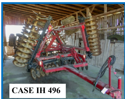
CASE IH 496