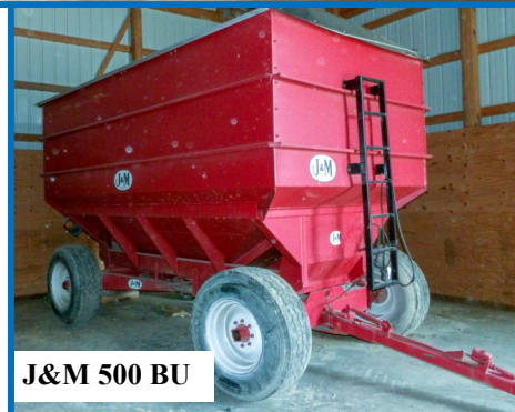
J&M 500 BU